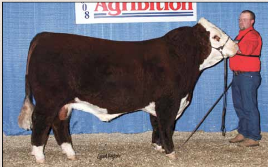
GHC Cardinal 57T — Sire of Lots 5 and 6.

Cardinal is super stout and has a great muscle pattern to him. His mother is a great cow in the Crittenden Bros. herd in Saskatchewan. A Canadian Agribition class winner.