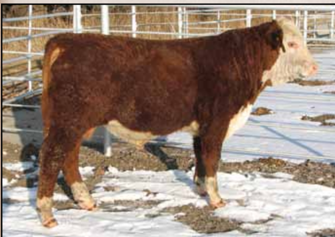
Lot 6 — CT Carrington 80X

Cardinal is super stout and has a great muscle pattern to him. His mother is a great cow in the Crittenden Bros. herd in Saskatchewan. A Canadian Agribition class winner.