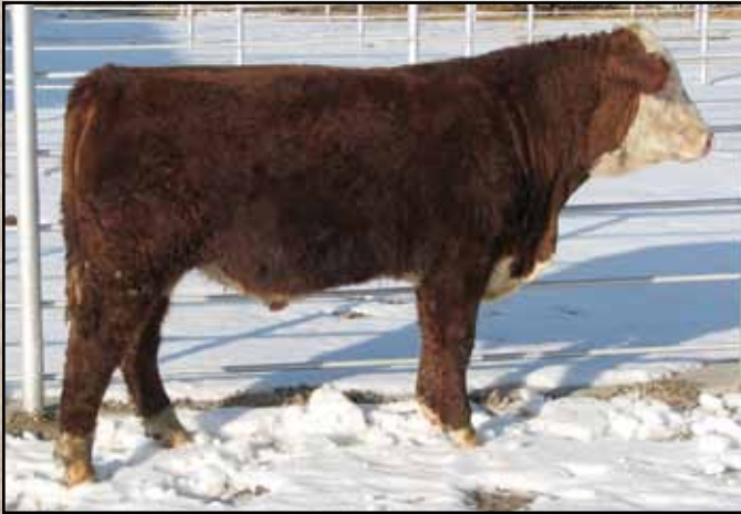
Lot 5 — CT Cardinal 65X