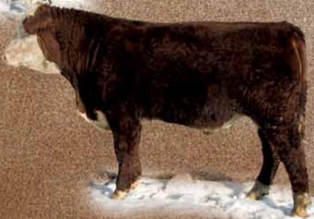
CT Cardinal 65X