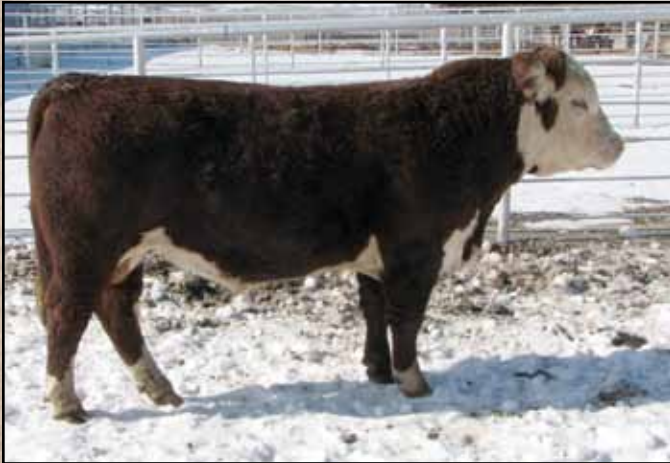
Lot 21 — CT Tiger 87W