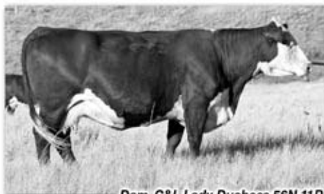
Dam, C&L Lady Duchess 56N 11R

• A dark, heavily pigmented, rugged, larger statured kind of bull. Impressive weaning weight and nursing ratio. One of nine 28M sons to sell!