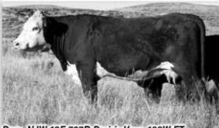
Dam, NJW 12E 707B Prairie Vaca 193W ET

• A medium-framed, really solid made, solid marked, light colored prospect. He will make a good, easy doing range bull. Dam 193W is a hard working two year old and is a full sister to our 80L cow. Lot 94Y shows good eye pigment and moderate birth weight.