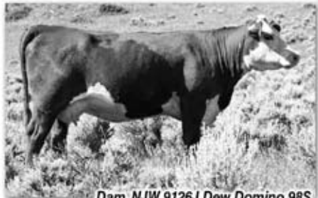
Dam, NJW 9126J Dew Domino 98S