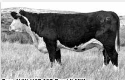
Dam, NJW 115R 95R Remidi 62W

• A well made, freckle-faced, light birth weight bull out of a really good uddered 95R two year old that sure did a fine job on her first calf. Sire 155W is a 4037 son out of our beautiful 34S cow!