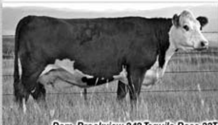
Dam, Brookview 242 Tequila Rose 33T

• A really well designed Trust son that is clean made, red necked, well pigmented and eye appealing. His dam is easy doing, deep bodied and sound.