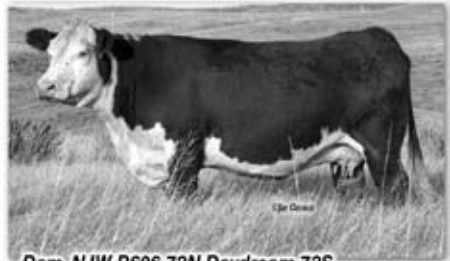
Dam, NJW P606 72N Daydream 73S

• Homegrown ...and a Next Generation NJW herd sire! A genuine "Beef Bull", he's loaded with natural thickness, volume, performance ...the kind we're all searching for! His P606 dam never misses and is also dam of Trust 100W, prominent NJW herd sire and 2012 Denver Supreme Champion Hereford Bull! Sire SHF Wonder W18 has been infused here for his added depth and dimension. 8Y presents a breed leading profile and top performance and will be used extensively in our breeding program. Full brothers sell as Lots 4Y, 10Y, 15Y, 42Y.