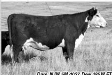
Dam, NJW 5M 4037 Dew 185W ET

• Lot 110Y is moderate framed, sound and well made. Dam 185W is a very attractive two year old 4037 x 5M that worked hard on her first calf! 110Y is from the same cow family as our Durango 44U and Ribeye 88X herd bulls.