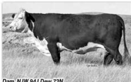
Dam, NJW 94J Dew 72N

• Another bull we kept back for ourselves last year. A full brother to Trust's dam 73S, as well as to Lots 52Y and 73Y. Dark colored and freckle-faced.