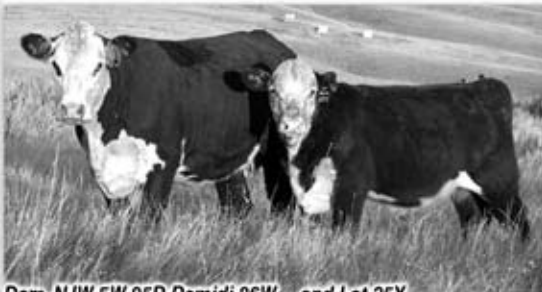
Dam, NJW 5W 95R Remidi 86W ...and Lot 25Y

• A well made Progress P20 son out of a hard working two year old 95R daughter that descends from the powerful 5M cow family! Sire P20 has been a really good calving ease and maternal trait sire!