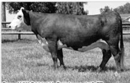
Dam, NJW P606 80L Daydream 34S ET

• A big framed, rugged, deep ribbed, well marked, red-eyed 63J son. Dam 34S is a wonderful P606 daughter that Colyer Herefords now own. A maternal brother to 20Y is our herd sire 155W.