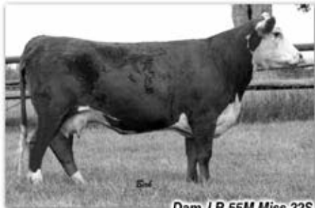
Dam, LB 55M Miss 32S

• A moderate-framed bull with a good birth weight and top YW ratio 109! Dam is a nice 55M daughter that we purchased from Lloyd Brown.