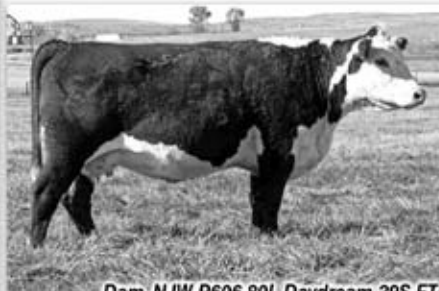
Dam, NJW P606 80L Daydream 39S ET

• Here's a bold and powerful herd sire candidate! Wide, deep quartered, deep flanked and deep ribbed, Lot 120Y is dark colored with good pigment. His dam is a solid, deep, broody P606 daughter with an excellent udder. His sire is a full blood brother to the Boulder 57G sire that we have used so much. This performance bull took honors for posting the highest adj. WW and second highest adj. YW. Retaining a one-quarter semen interest.