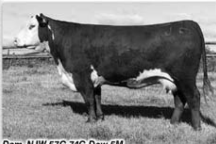
Dam, NJW 57G 74G Dew 5M

• A big, strong, extra long bodied Trust 100W son backed by our superb herd matron 5M. Lot 85Y is wide-based and deep flanked with a real good, deep lower quarter. This set of ET sons out of Trust and 5M show a little more birth weight, but all are extremely long bodied. Full brothers sell as Lots 81Y, 86Y.