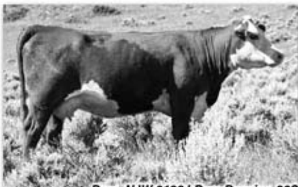
Dam, NJW 9126J Dew Domino 98S

• The combination of two standout NJW cow families, breed leader 9126J and the Denver 2012 Supreme Champion Hereford Bull! Very complete, balanced and wide-based with shape and depth, this dark, solid marked, well pigmented herd sire candidate will be a strong breeding tool. He is maternal brother to herd sires Durango 44U and Ribeye 88X. Lots 82Y and 83Y are identical twins, the result of egg splitting post fertilization, they have identical DNA and identical footnotes. Selling choice and retaining a one-half semen interest in the buyer's choice bull.