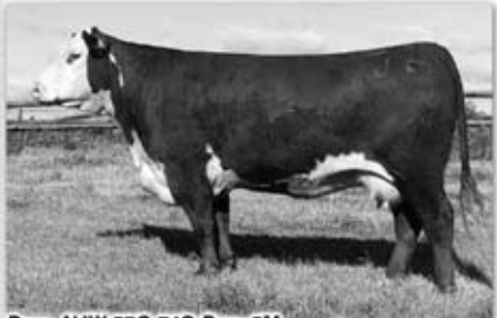
Dam, NJW 57G 74G Dew 5M

• You will admire this guy for his great profile, length of body, depth of rib and ample, long, deep quarter. He's real smooth shouldered, tight sheathed and short marked with a great hair coat! A well read pedigree and great set of numbers. We think these 38W sons will be ideal "rancher bulls" and "cowherd builders."