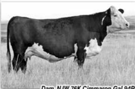
Dam, NJW 76K Cimmaron Gal 94R

• This dark, heavily pigmented M326 son is out of a big, powerful, beautiful uddered 81N daughter. We kept him back for ourselves and have several nice calves by him.