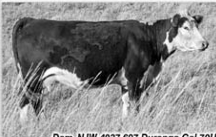
Dam, NJW 4037 697 Durango Gal 70U

• Really square, wide based and thick made with a strong back leg and good stifle muscle. Middle-framed with a bit of extra white up the back legs, but would work great on black cows. Good combination of low birth and high weaning. Dam is a super deep bodied, easy doing 4037 daughter.