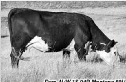
Dam, NJW 1S 94R Montana 50U

• Not the biggest framed bull in the pen, but built square and solid. Backed by a nice ordered, moderate framed dam.