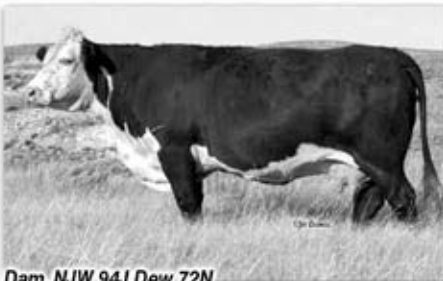
Dam, NJW 94J Dew 72N

• Sire P606 is a powerful female producer plus this guy is backed by our 72N cow. Full brothers sell as Lots 52Y and 150X.