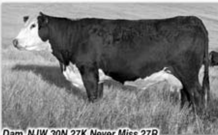
Dam, NJW 30N 27K Never Miss 27R

• Solid, well balanced, deep sided prospect out of an easy fleshing, nice uddered, solid producing cow. We really like sire Beef 38W and are using him extensively in our program!