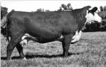
Maternal Granddam, GV 579 Victoria 9710