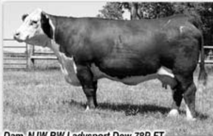
Dam, NJW BW Ladysport Dew 78P ET