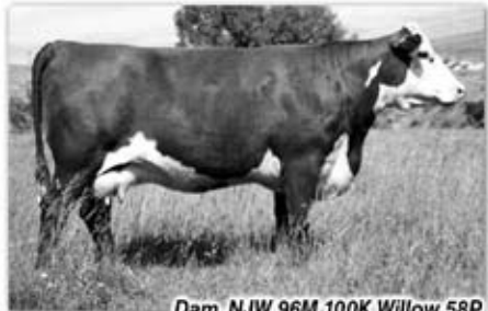
Dam, NJW 96M 100K Willow 58P

• Dark, well pigmented prospect backed by a very attractive, moderate sized, feminine, nice uddered Custom 100K daughter.