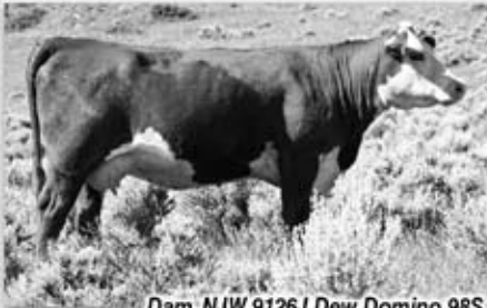
Dam, NJW 9126J Dew Domino 98S

• The combination of two standout NJW cow families, breed leader 9126J and the Denver 2012 Supreme Champion Hereford Bull! Very complete, balanced and wide-based with shape and depth, this dark, solid marked, well pigmented herd sire candidate will be a strong breeding tool. He is maternal brother to herd sires Durango 44U and Ribeye 88X. Lots 82Y and 83Y are identical twins, the result of egg splitting post fertilization, they have identical DNA and identical footnotes. Selling choice and retaining a one-half semen interest in the buyer's choice bull.