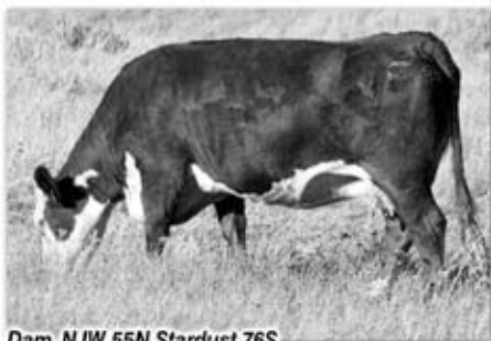
Dam, NJW 55N Stardust 76S

• Low birth, smooth shoulderd, well made, young prospect that should work well on heifers. He is out of our great herd matron 76S who has an excellent udder. We are using Lot 166Y's full brother on our heifers, a full sister came small and then went on to be Reserve Jr. Heifer Calf Champion in Denver. Also a maternal brother to our herd sire Beef 38W.