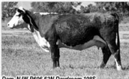
Dam, NJW P606 53N Daydream 108S

Selling One-half Semen Interest and One-half Possession.