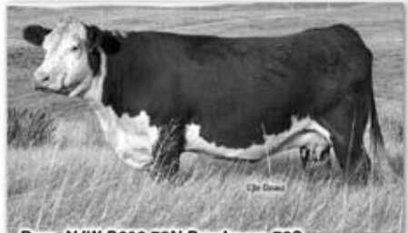
Dam, NJW P606 72N Daydream 73S

• Another long sided, thick, solid red W18 x 73S that is a flush mate to 4Y, 8Y, 10Y and 42Y. A good, balanced set of numbers and backed by a wonderful cow line!