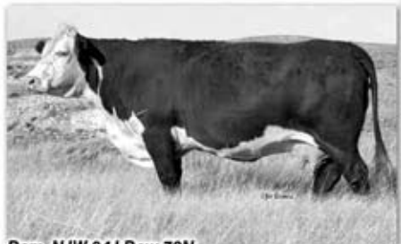
Dam, NJW 94J Dew 72N

• This very well put together P606 son is a full brother to the dam of Trust 100W and should make a very useful breeding tool. His Boulder 57G dam is sound and attractive at age nine. Full brothers sell as 73Y and 150X.