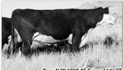
Dam, NJW 539G 8E Emma 144U ET

• A useful, solid 719T son that offers an adj. WW 730 lb. and NR 108. Dam is very nice uddered 8E daughter.