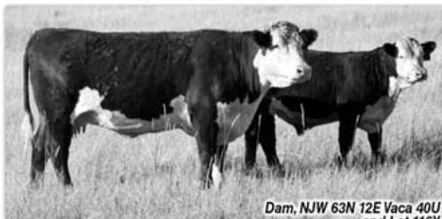
Dam, NJW 63N 12E Vaca 40U ...and Lot 116Y

• Lot 116Y is really wide-based, well balanced and deep flanked with plenty of thickness. Dark colored and red-to-the-ground. Dam is a good-sized 63N daughter out of the 19D cow family.