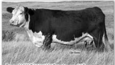
Dam, NJW P606 72N Daydream 73S

• This low birth weight top prospect is very well balanced with extra muscle expression, thickness and doing ability. Lot 4Y is a maternal brother to Trust 100W and full brother to Sale Feature Lots 8Y, 10Y, 15Y and 42Y. Retaining one-quarter semen interest.