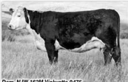
Dam, NJW 163M Vickyetta 9475

• This guy has an exceptional two year old mother that went all-out on her first calf! She's easy keeping and deep sided with a lovely udder. Lot 35Y, himself, is an easy-doer with plenty of shape and capacity.