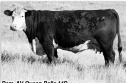
Dam, AH Queen Belle 14R

• Square hipped, wide topped and wide based with a lot of round to his muscle. Dam 14R is a deep, broody, easy keeping matron with an excellent udder.