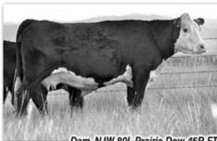
Dam, NJW 80L Prairie Dew 45R ET

• One of the top low birth bulls in the crop. Loads of style and eye appeal with plenty of depth and a good, square hip. This guy moves out and presents himself very much like his sire! Dam 45R is one of our best as are his granddam and great granddam. 45R has had six calves with an avg. BW 73.5 lbs., so you know the low birth weight is really there!