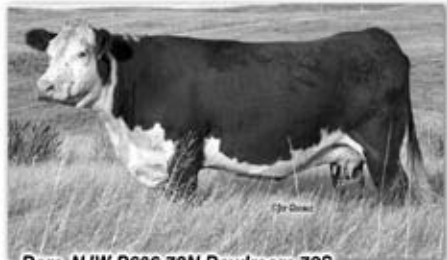
Dam, NJW P606 72N Daydream 73S

• Exactly what we want our commercial steer calves to be like ... small and vigorous at birth, then weaning off heavy! So complete and well designed with perfect pigment and eye set, Lot 42Y has been a favorite all along. Full brothers sells as Lots 4Y, 8Y, 10Y, 15Y.