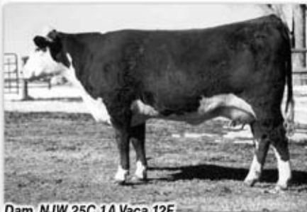
Dam, NJW 25C 1A Vaca 12E

• A stout, rugged kind of bull with a 740 lb. adj. WW and out of one of our all-time best cows! Dam 12E raised 11 natural calves with an avg. NR of 108. She raised her last natural calf at age 14, a bull with an adj. WW 775 lbs. / NR 116. There are 49 progeny to her credit. She is the dam, granddam or great granddam of some of our top cows including 80L, 34S, 39S, 43T, 96P, 63P and 51U.