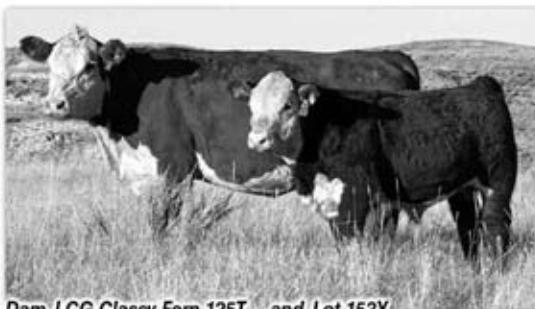
Dam, LCG Classy Fern 125T ...and, Lot 153Y

• Here's a real clean fronted, stylish, younger Trust 100W son. Dam is a smaller cow that always delivers a fancy calf in the fall!