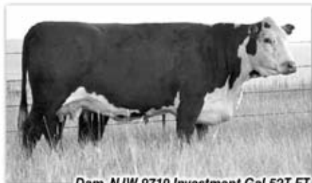
Dam, NJW 9710 Investment Gal 52T ET

• A low birth weight Trust 100W son out of a really attractive, good uddered 109R daughter. If you need pigment and red all over, this is the bull to buy!