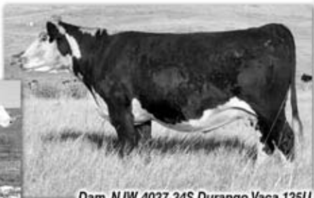
Dam, NJW 4037 34S Durango Vaca 135U Great Granddam, NJW 12E Prairie 80L