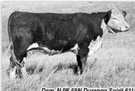
Dam, NJW 55N Durango Spirit 61U

• A low birth weight, complete, well muscled, moderate framed Trust 100W son. Dam 61U is a very nice uddered 4037 daughter from the Spirit Queen cow family. Lot 56Y shows nice pigment, solid markings and a superb set of EPDs!