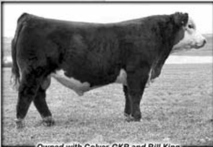
Owned with Colyer, GKB and Bill King

Semen $35/Unit (10 unit minimum) • Certificates $65