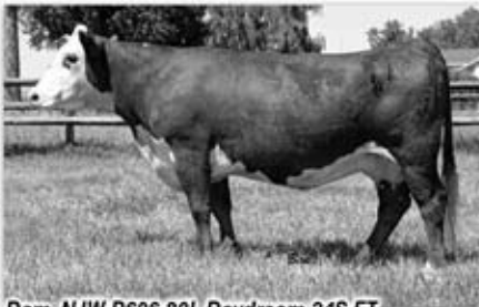
Dam, NJW P606 80L Daydream 34S ET

• This deep ribbed 63J son has two wonderful maternal sisters and one brother in our herd! Dam is an outstanding, beautiful uddered P606 daughter. The 63J daughters are broody, deep bodied and milk very well!