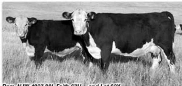
Dam, NJW 4037 80L Faith 67U ...and Lot 63Y

• This favorite 28M son offers extra volume, capacity and plenty of muscle along with an 80 lb. BW ...a very appealing package, both to the eye and on paper. His young, modest sized, super deep ribbed, efficient 4037 dam is from the 19D cow family. A practical, functional, herd building tool to be used at NJW in making our Next Generation. Selling One-half Semen Interest and One-half Possession.