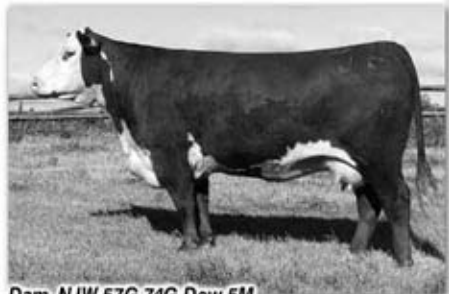
Dam, NJW 57G 74G Dew 5M

• A real nice 38W x 5M son with a great set of numbers. The 5M cow adds extreme length to all her progeny. A full brother sells as Lot 65Y.