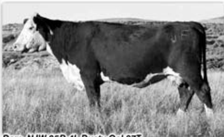
Dam, NJW 95R 4L Dusty Gal 97T

• A stout, powerful and commanding Trust 100W son with plenty of thickness and depth of rib. This top herd sire candidate sports a NR 115 / YR 115 and 42 cm. testicles. He descends from the big performance Serenade cow family. Retaining one-quarter semen interest.