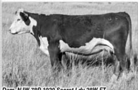
Dam, NJW 78P 1030 Secret Ldy 28W ET

• A calving ease, smaller-framed bull out of a tight and tidy uddered two year old Top Secret cow. His sire P20 is known for lowering birth and good milk.