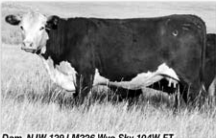
Dam, NJW 139J M326 Wyo Sky 104W ET

• A well numbered, smooth made Durango 155W son out of a super hard working two year old from the Serenade cow line. Sire Durango 155W is out of one of the best uddered cows you'll ever find. Note his big NR 110!