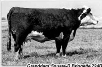
Granddam, Square-D Brigette 724D

• This Maxium 28M son is out of a deep, broody Cowtown 60M daughter that has an ideal udder.