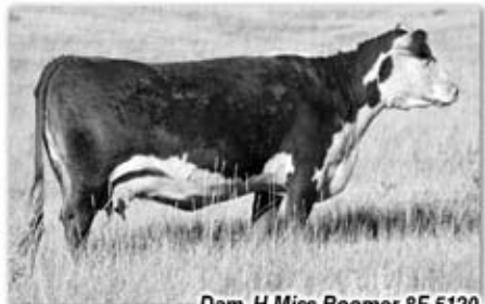
Dam, H Miss Boomer 8E 5120

• A real eye appealing 18U son that is backed by a good P606 dam. Lot 97Y shows good thickness and balance!