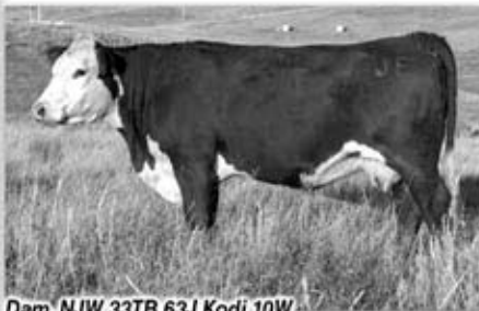
Dam, NJW 33TB 63J Kodi 10W

• This medium-framed, solid marked, well made bull comes with a lot of maternal punch from both sides of his pedigree. Dam 10W is one of my favorite two year olds ...very nice udder, lots of body and easy doing. The 3027 daughters are making excellent cows all over the country!