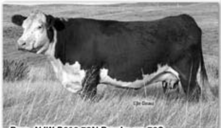
Dam, NJW P606 72N Daydream 73S

Selling One-half Semen Interest and One-half Possession.